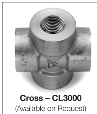
Cross – CL3000 (Available on Request)