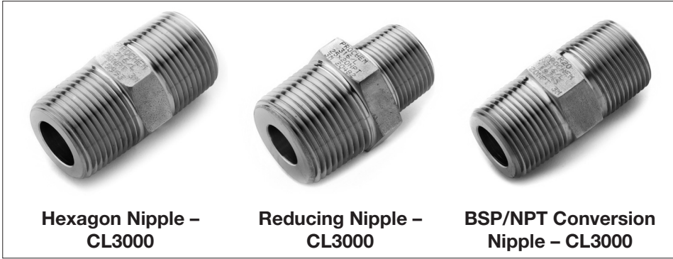
Hexagon Nipple – CL3000