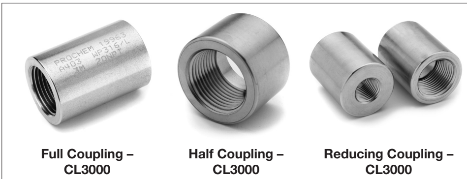
Full Coupling – CL3000