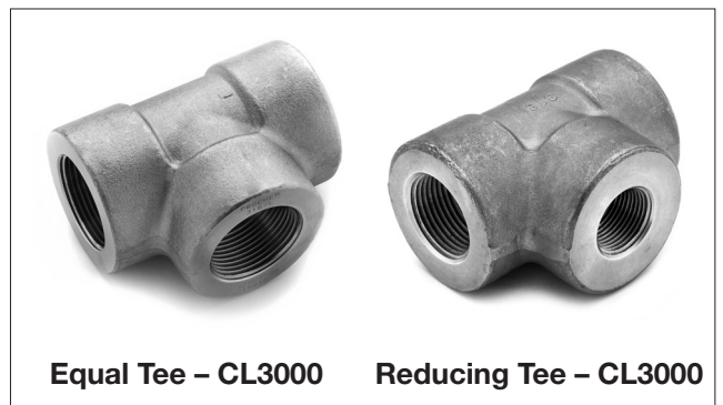
Equal Tee – CL3000