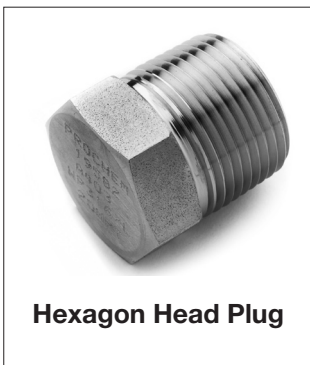
Hexagon Head Plug