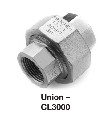
Union – CL3000