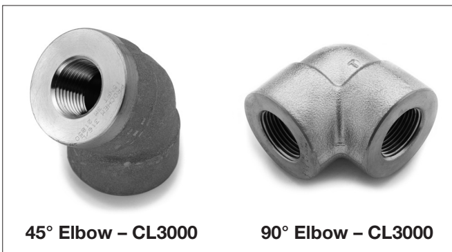
45° Elbow – CL3000