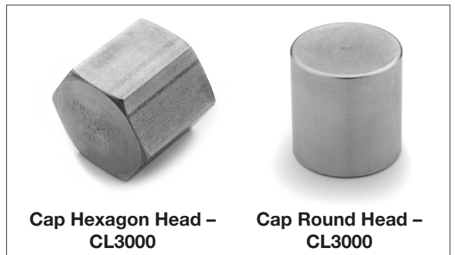
Cap Hexagon Head – CL3000