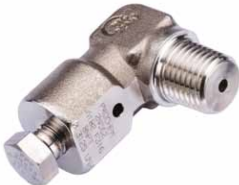
90° bleed valve with calibration port