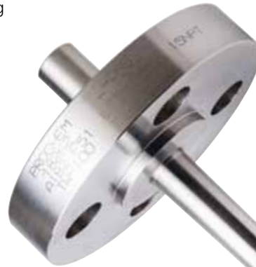
Duplex 1-piece Thermowell

Wake Frequency Calculations to ASME PTC 19.3