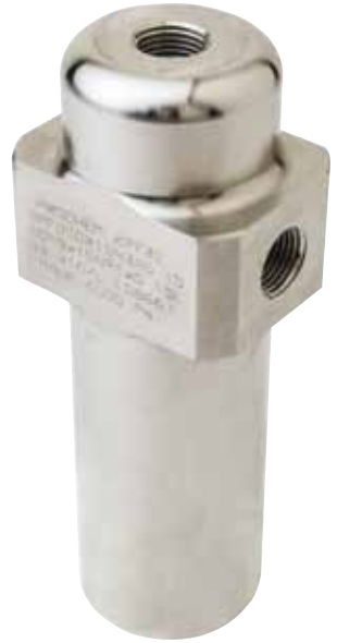
Welded 2-piece Seal Pot