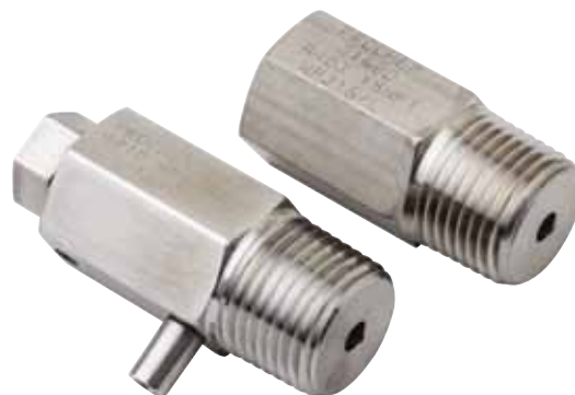
Custom Bleed Valve with increased orifice to prevent plugging

Contact Prochem Manufacturing for help with your Engineered Solution manufacturing@prochem.com.au