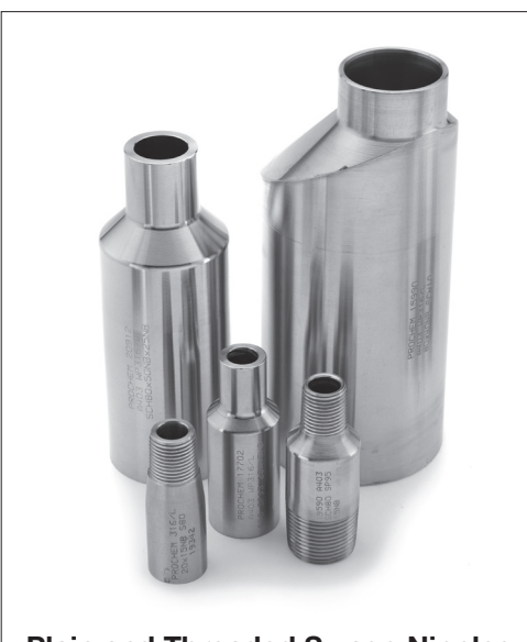
Plain and Threaded Swage Nipples

These fittings are available in ASTM A403 WP316/316L with other materials available on request.