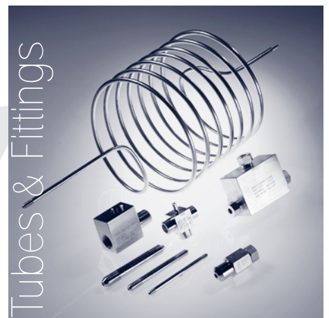
Tubes & Fittings

Needle Valves Relief Valves Check Valves Quick Disconnect Couplings Bulkheads Rupture Discs Filters Pressure Gauges and Snubbers Assembly Tools High-Pressure Hose